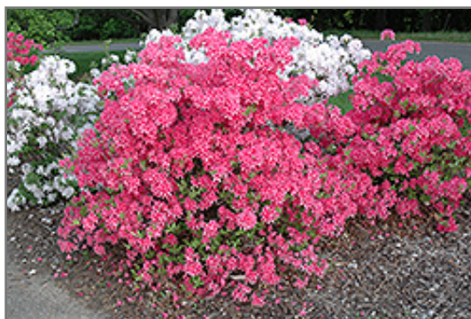
Rosy Lights Azalea in bloom