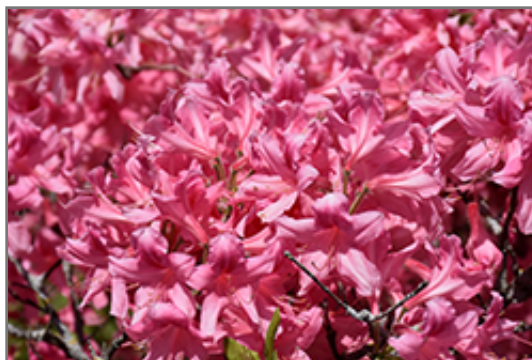
Rosy Lights Azalea flowers