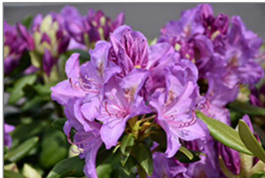
Boursault Rhododendron flowers