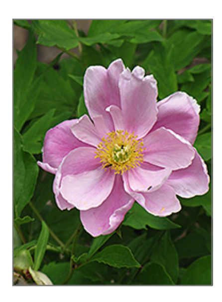
Praecox Anemone flowers

An outstanding selection for the mid to late summer garden; branching stems of deep pink flowers are great for cutting;; good for a partial shade area; may need mulch in colder winter areas; beautiful when massed or in containers