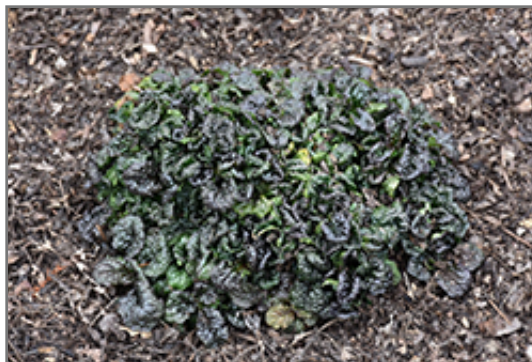
Mini Crisp Red Bugleweed