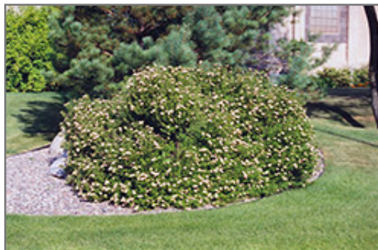
Pink Beauty Potentilla in bloom