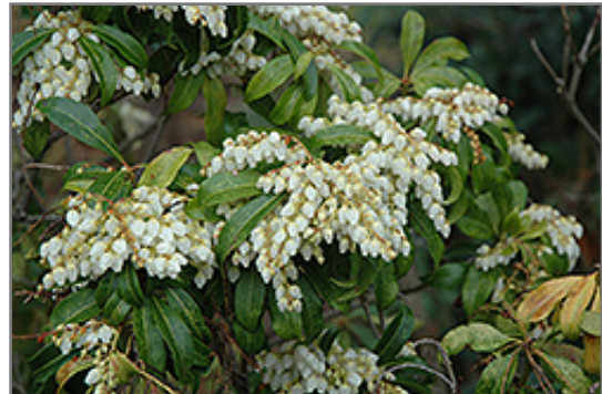
Red Mill Japanese Pieris flowers