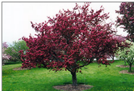
Profusion Flowering Crab in bloom