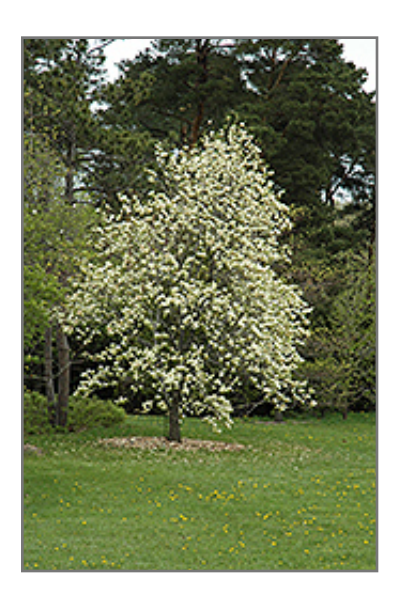
Elizabeth Magnolia flowers