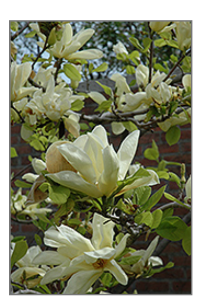
Elizabeth Magnolia flowers

Elizabeth Magnolia will grow to be about 35 feet tall at maturity, with a spread of 25 feet. It has a low canopy with a typical clearance of 4 feet from the ground, and should not be planted underneath power lines. It grows at a medium rate, and under ideal conditions can be expected to live for 80 years or more.