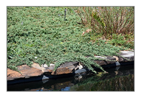
Blue Rug Juniper

Blue Rug Juniper will grow to be about 8 inches tall at maturity, with a spread of 7 feet. It tends to fill out right to the ground and therefore doesn't necessarily require facer plants in front. It grows at a slow rate, and under ideal conditions can be expected to live for approximately 30 years.