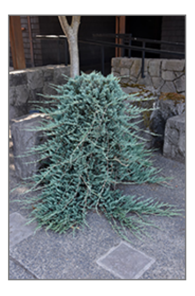
Blue Rug Juniper

Blue Rug Juniper is recommended for the following landscape applications;