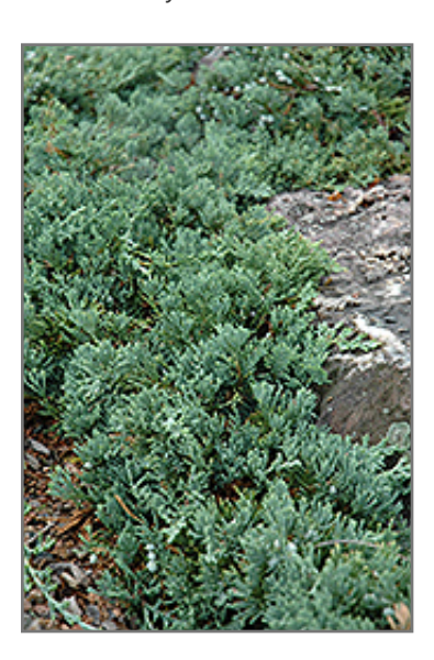
Blue Rug Juniper foliage