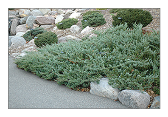
Hughes Juniper

A top notch and popular groundcover evergreen for color accent use in the landscape, featuring silvery-blue foliage all season long, ground hugging and wide spreading; extremely adaptable and hardy; superb color accent groundcover