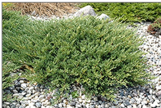
Andorra Juniper

An incredibly beautiful groundcover evergreen for general landscape use, featuring blue-green foliage which takes on a purplish tinge in winter, attractively arching low branching habit, wide spreading; extremely adaptable and hardy; a fine groundcover