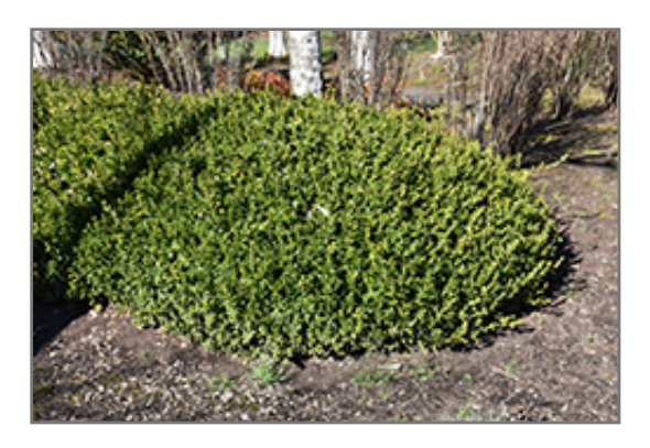
Winter Gem Boxwood

This compact boxwood is great for smaller areas; foliage bronzes in winter adding seasonal interest; an extremely versatile shrub that's ideal for small and formal hedges or topiary, takes pruning exceptionally well