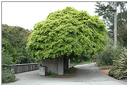
Momiji Japanese Maple