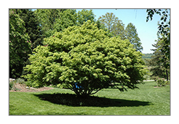
Ivy-leaved Maple

This tree does best in full sun to partial shade. It does best in average to evenly moist conditions, but will not tolerate standing water. It is particular about its soil conditions, with a strong preference for rich, acidic soils. It is somewhat tolerant of urban pollution. This species is not originally from North America.