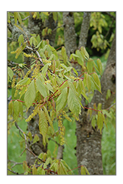
Ivy-leaved Maple foliage