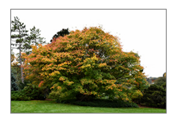
Ivy-leaved Maple in fall