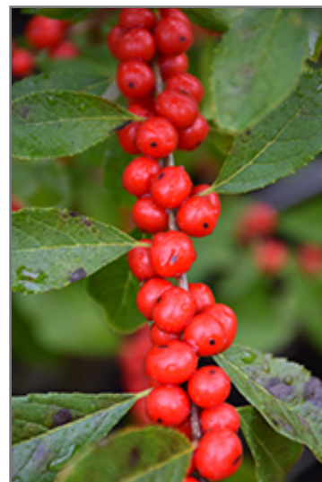
Red Sprite Winterberry fruit

Red Sprite Winterberry is recommended for the following landscape applications;