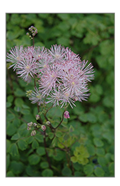
Meadow Rue flowers

A beautiful plant from our native meadows with columns of steely blue foliage arising in spring, turning to a glaucous green; stately stems topped with bright white and violet flowers; lovely massed along borders; will readily naturalize