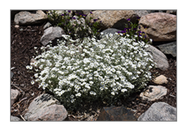
Yo Yo Snow-In-Summer in bloom