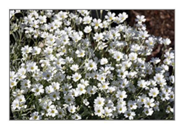
Yo Yo Snow-In-Summer flowers

Yo Yo Snow-In-Summer is recommended for the following landscape applications;