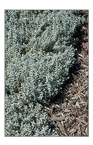
Yo Yo Snow-In-Summer foliage

This plant should only be grown in full sunlight. It prefers dry to average moisture levels with very well-drained soil, and will often die in standing water. It is considered to be drought-tolerant, and thus makes an ideal choice for a low-water garden or xeriscape application. It is not particular as to soil type or pH. It is highly tolerant of urban pollution and will even thrive in inner city environments. This is a selected variety of a species not originally from North America. It can be propagated by division; however, as a cultivated variety, be aware that it may be subject to certain restrictions or prohibitions on propagation.