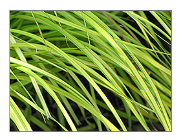
Bowles' Golden Sedge foliage

This is a relatively low maintenance plant, and is best cleaned up in early spring before it resumes active growth for the season. It has no significant negative characteristics.