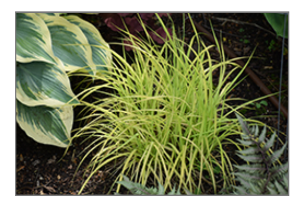
Bowles' Golden Sedge

Bowles' Golden Sedge is an herbaceous perennial grass with a shapely form and gracefully arching stems. It brings an extremely fine and delicate texture to the garden composition and should be used to full effect.