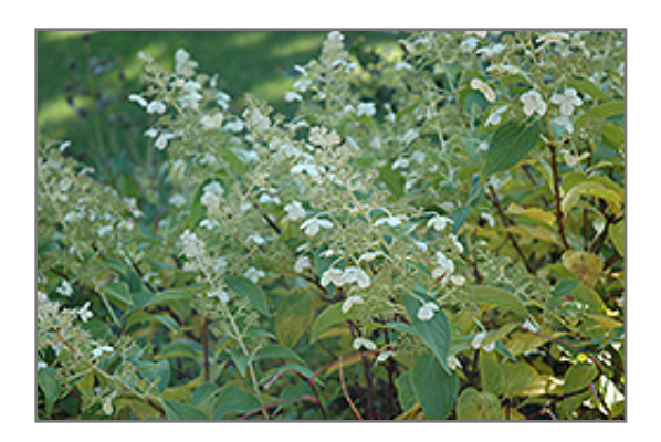
Kyushu Hydrangea flowers

A showy upright medium-sized shrub prized for its upright spires of mixed sterile and fertile white flowers in mid to late summer, blooms well in shade; somewhat coarse in appearance, regular pruning recommended, needs slightly acidic well-drained soil