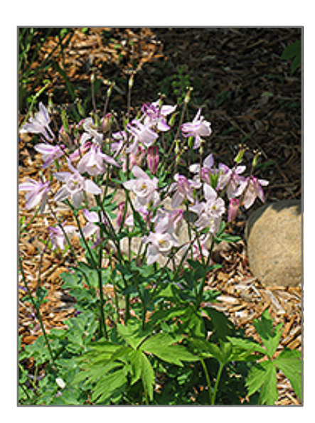
Pumila Columbine flowers

Attractive violet flowers with snowy white edged cups and interesting spurred petals rise over the medium green delicate foliage; a wonderful addition to border edges or massed in the garden; will tend to self seed