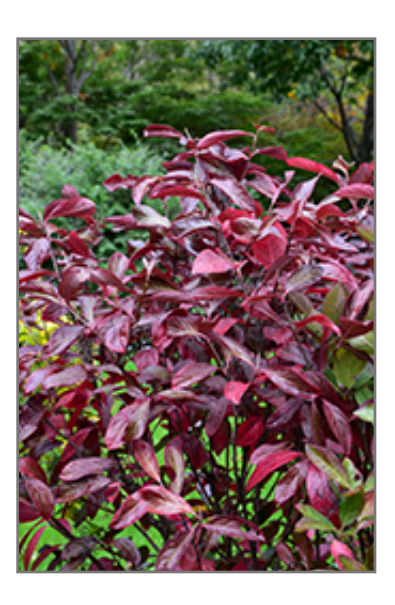
Winterthur Viburnum in fall

This shrub does best in full sun to partial shade. It prefers to grow in average to moist conditions, and shouldn't be allowed to dry out. It is not particular as to soil type or pH. It is highly tolerant of urban pollution and will even thrive in inner city environments. Consider applying a thick mulch around the root zone in winter to protect it in exposed locations or colder microclimates. This is a selection of a native North American species.