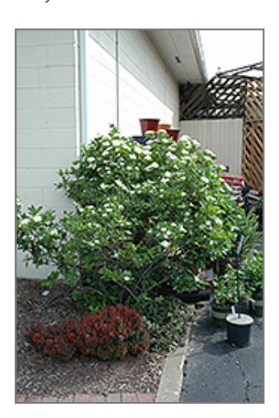
Winterthur Viburnum in bloom