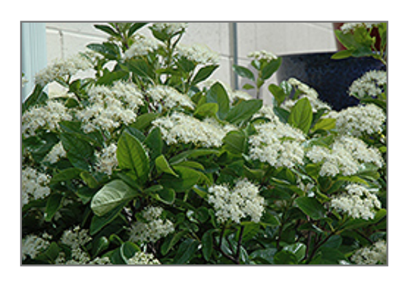
Winterthur Viburnum flowers

Winterthur Viburnum is recommended for the following landscape applications;