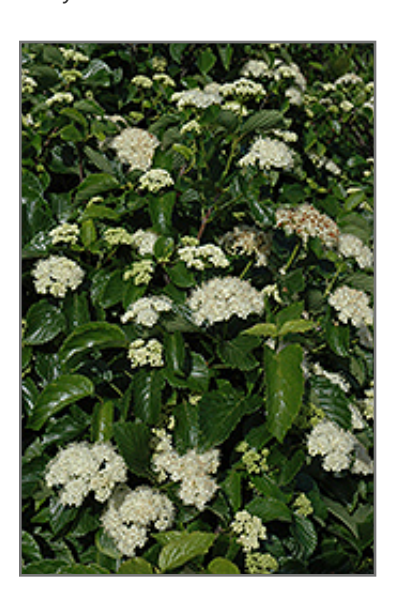
Raspberry Tart Viburnum flowers