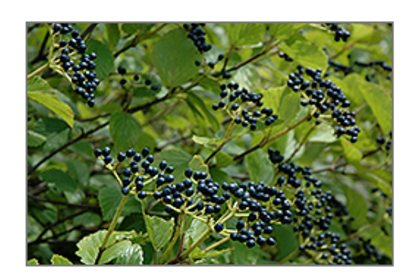
Raspberry Tart Viburnum fruit

Raspberry Tart Viburnum is recommended for the following landscape applications;