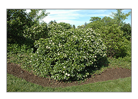
Raspberry Tart Viburnum in bloom

This shrub does best in full sun to partial shade. It prefers to grow in average to moist conditions, and shouldn't be allowed to dry out. It is not particular as to soil type or pH. It is highly tolerant of urban pollution and will even thrive in inner city environments. This is a selection of a native North American species.