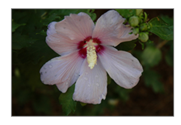
Bluebird Rose of Sharon flowers

A tall, stiffly upright shrub with extremely showy light blue flowers with a deep red center which appear throughout summer, the flowers are individually beautiful; a very adaptable garden shrub, but does best in full sun