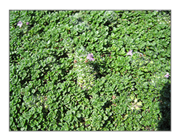
Elfin Creeping Thyme in bloom

This plant will require occasional maintenance and upkeep, and is best cleaned up in early spring before it resumes active growth for the season. Deer don't particularly care for this plant and will usually leave it alone in favor of tastier treats. Gardeners should be aware of the following characteristic(s) that may warrant special consideration;