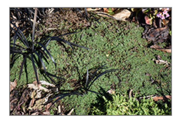
Elfin Creeping Thyme

Elfin Creeping Thyme is a dense herbaceous evergreen perennial with a ground-hugging habit of growth. It brings an extremely fine and delicate texture to the garden composition and should be used to full effect.