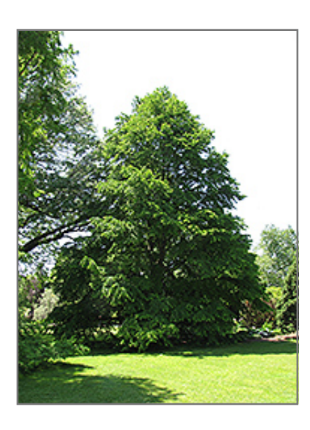
Katsura Tree