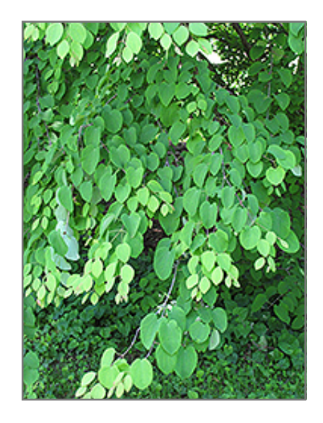
Katsura Tree foliage