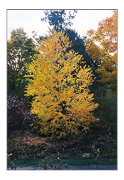
Katsura Tree in fall

This tree should only be grown in full sunlight. It prefers to grow in average to moist conditions, and shouldn't be allowed to dry out. It is particular about its soil conditions, with a strong preference for rich, acidic soils. It is somewhat tolerant of urban pollution, and will benefit from being planted in a relatively sheltered location. This species is not originally from North America.