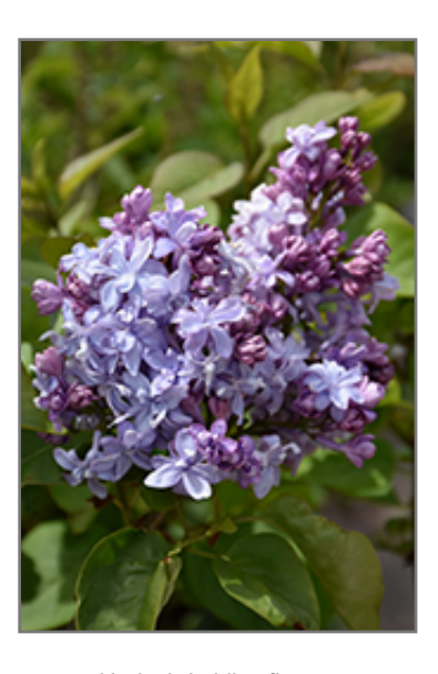
Nadezhda Lilac flowers

A magnificent spring blooming shrub bathed in deliciously fragrant double blue flowers held in upright panicles; upright, multi-stemmed habit, very hardy, tends to sucker, ideal for screening; full sun and well-drained soil, allow room for air movement