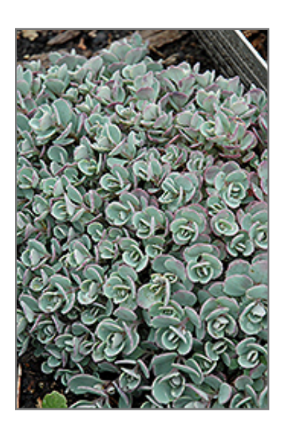
Japanese Stonecrop foliage

This Japanese native is perfect for the rock garden; a compact species with stunning blue-green foliage, pink stems and bears mounds of fuchsia toned flowers in fall; perfect for massed presentations and containers