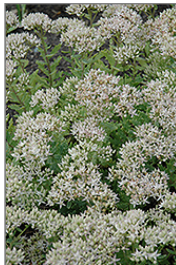
Thundercloud Stonecrop flowers

Thundercloud Stonecrop is recommended for the following landscape applications;