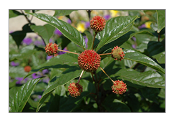
Button Bush flowers

Button Bush is a multi-stemmed deciduous shrub with a more or less rounded form. Its average texture blends into the landscape, but can be balanced by one or two finer or coarser trees or shrubs for an effective composition.