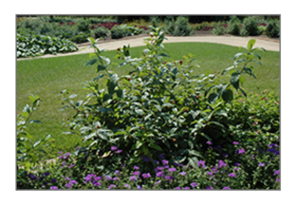
Button Bush

This shrub will require occasional maintenance and upkeep, and is best pruned in late winter once the threat of extreme cold has passed. It has no significant negative characteristics.