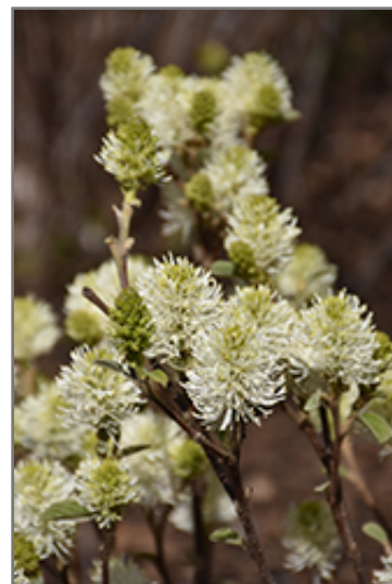
Mt. Airy Fothergilla flowers