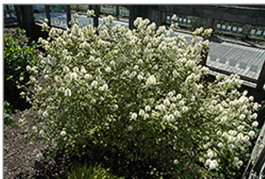
Mt. Airy Fothergilla in bloom