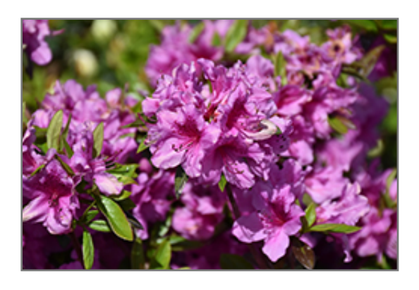
Herbert Azalea flowers

Herbert Azalea is an open multi-stemmed deciduous shrub with an upright spreading habit of growth. Its relatively coarse texture can be used to stand it apart from other landscape plants with finer foliage.