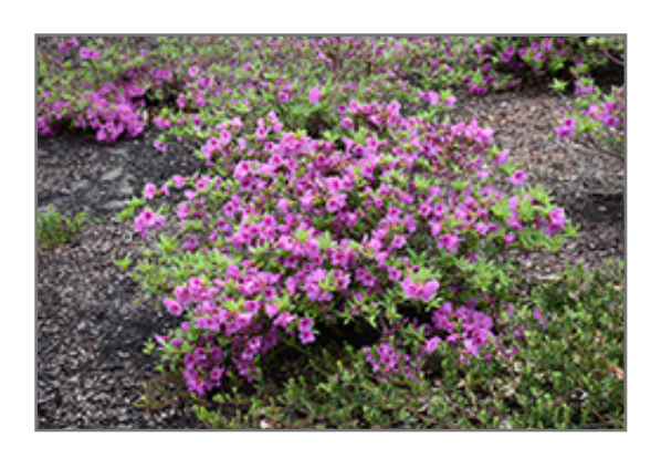
Herbert Azalea in bloom

This is a relatively low maintenance shrub, and should only be pruned after flowering to avoid removing any of the current season's flowers. It has no significant negative characteristics.