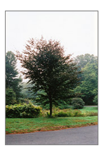
Rivers Purple Beech

A stunning enormous accent tree with very deep purple foliage all season long, absolutely beautiful when mature; quite particular about growing conditions, requires rich soil and significant moisture, give it lots of room to spread its branches