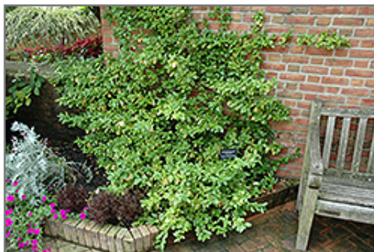
Sarcoxie Wintercreeper