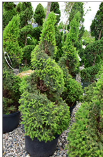
Dwarf Alberta Spruce (topiary form)