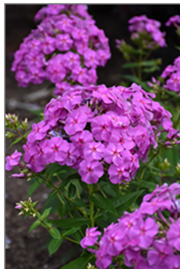
Flame Lilac Garden Phlox flowers