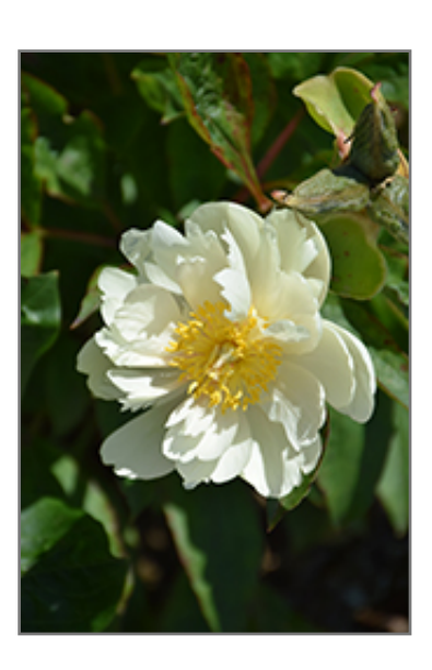
Claire de Lune Peony flowers

Claire de Lune Peony features bold lightly-scented creamy white cup-shaped flowers with yellow centers at the ends of the stems from early to mid summer. The flowers are excellent for cutting. Its compound leaves remain dark green in color throughout the season.