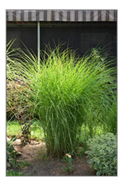
Gracillimus Maiden Grass

This plant does best in full sun to partial shade. It prefers to grow in average to moist conditions, and shouldn't be allowed to dry out. It is not particular as to soil type or pH. It is highly tolerant of urban pollution and will even thrive in inner city environments. This is a selected variety of a species not originally from North America. It can be propagated by division; however, as a cultivated variety, be aware that it may be subject to certain restrictions or prohibitions on propagation.