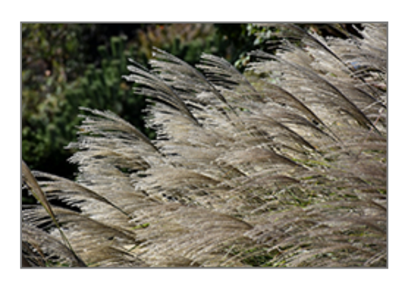
Gracillimus Maiden Grass fruit