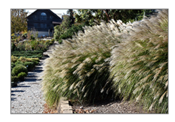
Gracillimus Maiden Grass

Gracillimus Maiden Grass is recommended for the following landscape applications;