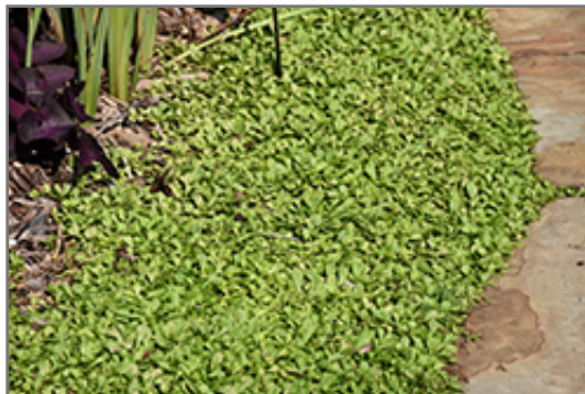
Creeping Mazus

Creeping Mazus will grow to be only 2 inches tall at maturity extending to 3 inches tall with the flowers, with a spread of 12 inches. Its foliage tends to remain low and dense right to the ground. It grows at a fast rate, and under ideal conditions can be expected to live for approximately 10 years. As an evergreen perennial, this plant will typically keep its form and foliage year-round.