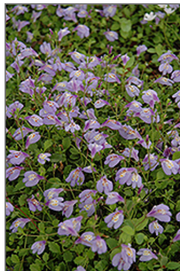
Creeping Mazus flowers

Creeping Mazus is recommended for the following landscape applications;