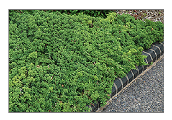
Green Mound Dwarf Japanese Juniper

Green Mound Dwarf Japanese Juniper is recommended for the following landscape applications;