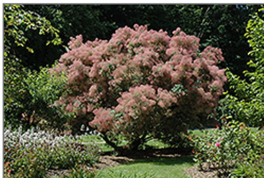
Grace Smokebush in bloom