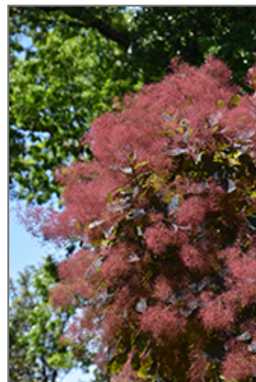
Grace Smokebush flowers