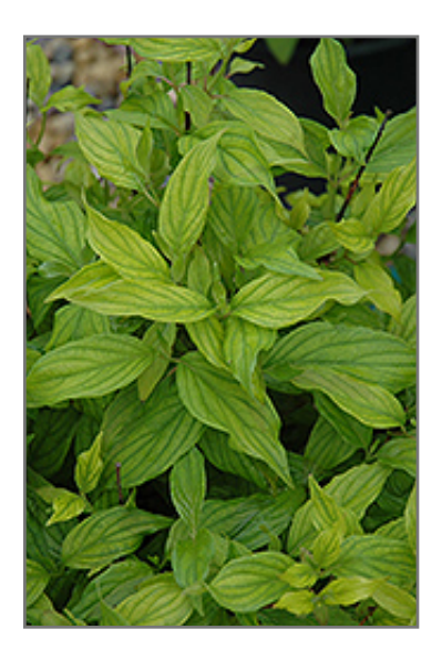
Kelsey Dogwood foliage