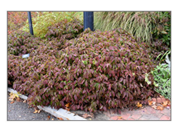
Kelsey Dogwood in fall

* This is a 'special order' plant - contact store for details