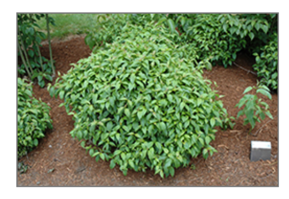
Kelsey Dogwood

Kelsey Dogwood is recommended for the following landscape applications;