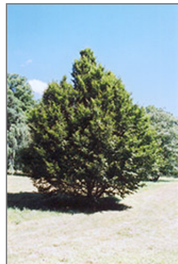
American Hornbeam