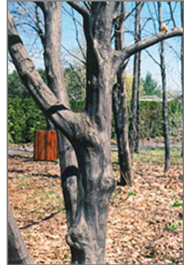
American Hornbeam bark

This tree performs well in both full sun and full shade. It is an amazingly adaptable plant, tolerating both dry conditions and even some standing water. It is not particular as to soil type or pH. It is somewhat tolerant of urban pollution. This species is native to parts of North America.