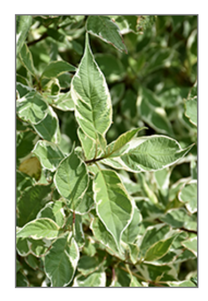
Silver Variegated Dogwood foliage