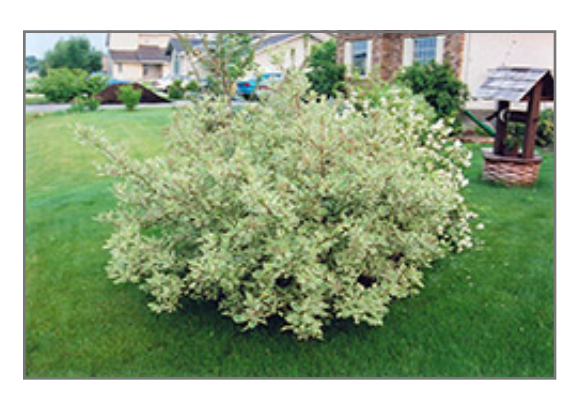
Silver Variegated Dogwood