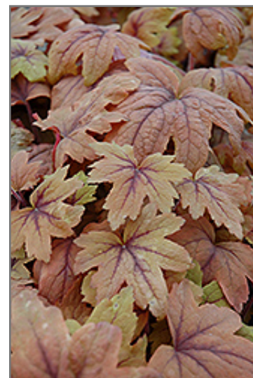
Sweet Tea Foamy Bells foliage