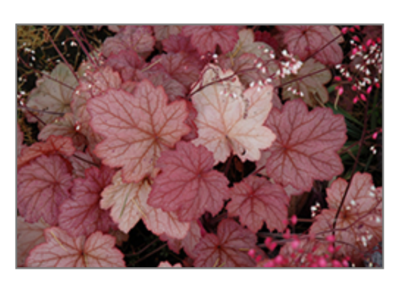
Georgia Peach Coral Bells foliage