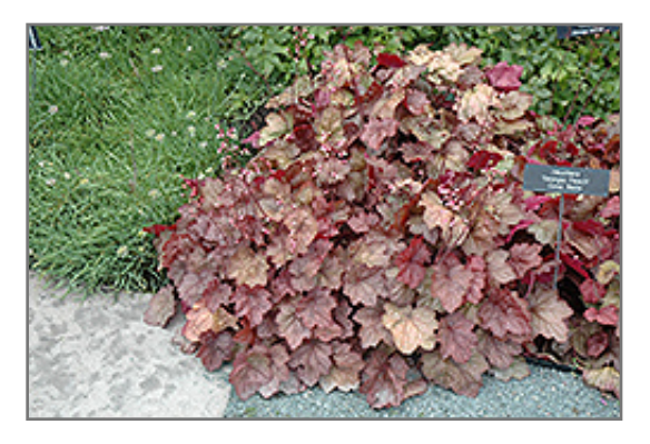
Georgia Peach Coral Bells