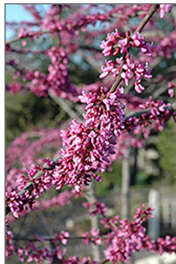
Northern Strain Redbud flowers

Northern Strain Redbud is recommended for the following landscape applications;