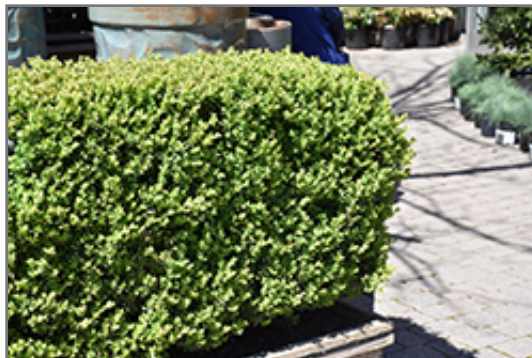
Green Mountain Boxwood