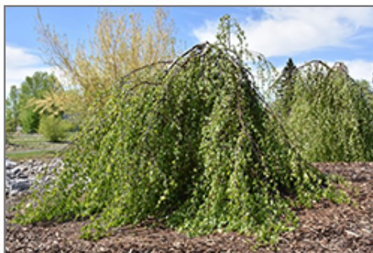
Young's Weeping Birch