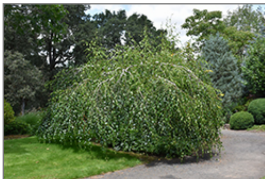
Young's Weeping Birch

Young's Weeping Birch will grow to be about 12 feet tall at maturity, with a spread of 8 feet. It has a low canopy with a typical clearance of 1 foot from the ground, and is suitable for planting under power lines. It grows at a fast rate, and under ideal conditions can be expected to live for approximately 30 years.