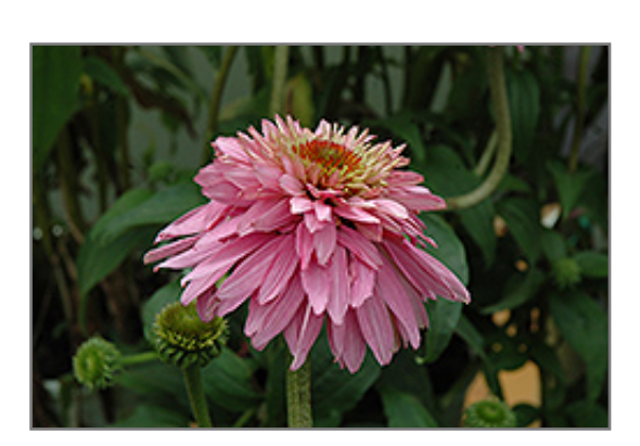
Pink Poodle Coneflower flowers