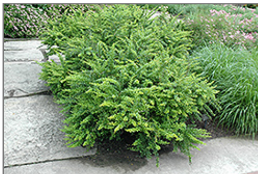
Sparkle Japanese Barberry