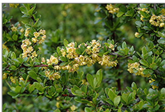
Sparkle Japanese Barberry flowers